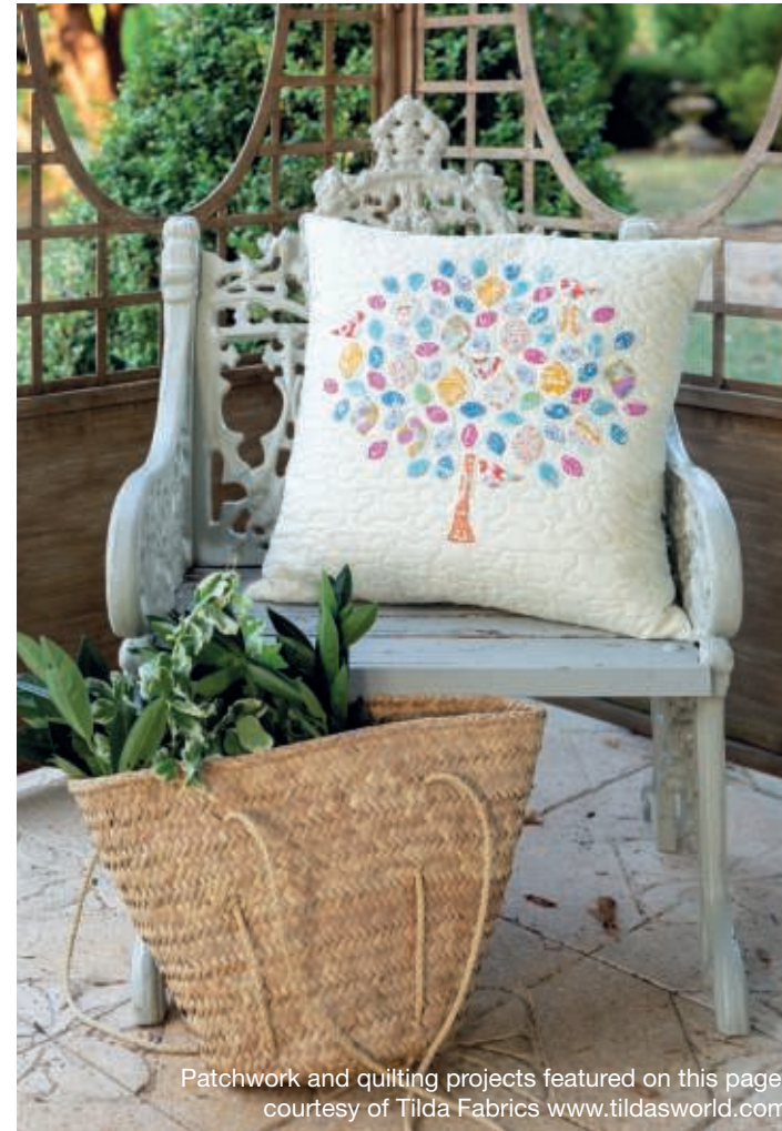
Patchwork and quilting projects featured on this page: courtesy of Tilda Fabrics www.tildasworld.com