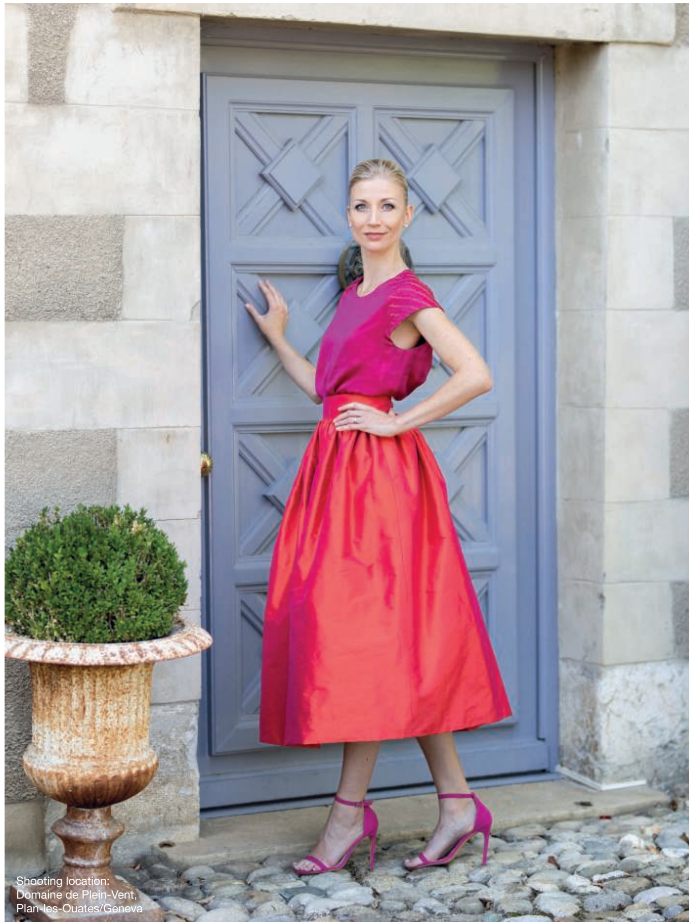
Shooting location: Domaine de Plein-Vent, Plan-les-Ouates/Geneva