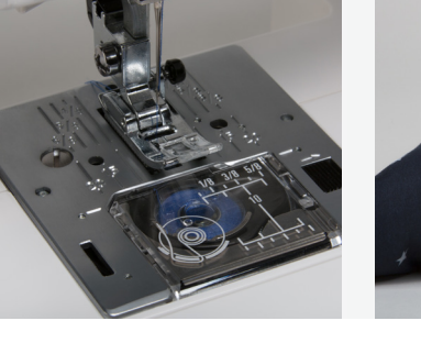
HORIZONTAL HOOK Thanks to the transparent bobbin cover, the thread supply is under control at every moment.